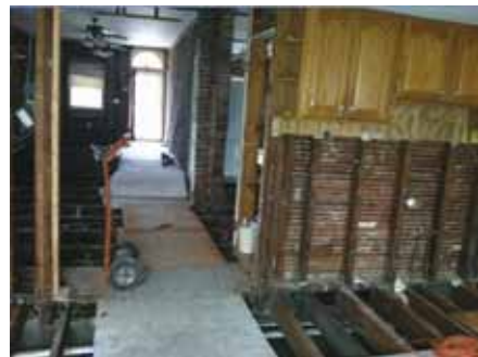
One of many homes Rotarians volunteered to gut for the homeowners.