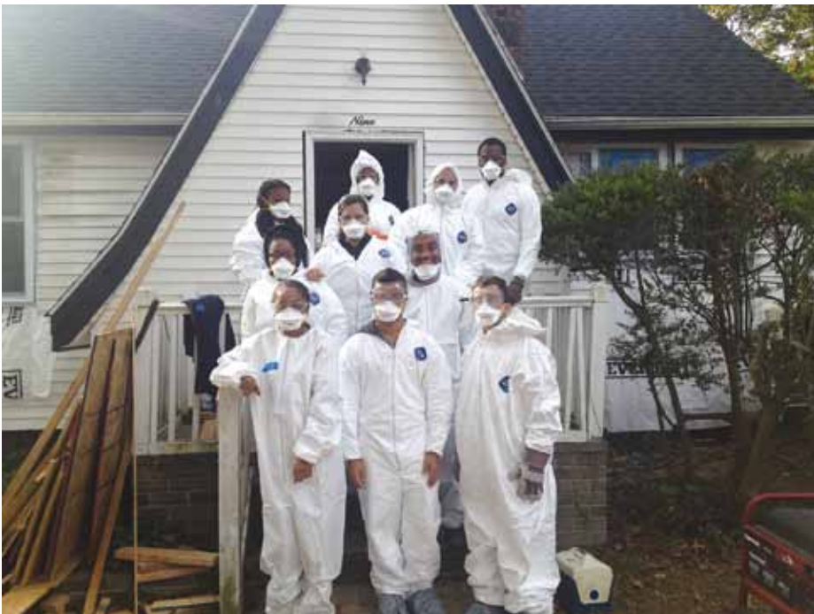
Taken October 19, 2013, in Long Island. The club partnered with All Hands Volunteers and the Robin Hood Foundation to help restore a home destroyed by Hurricane Sandy. Their task was to install insulation throughout the house.

The Volunteer Center serves Westchester and the Mid-Hudson Valley. The award will be presented at the 34th Annual Volunteer Spirit Award on April 24, 2014.