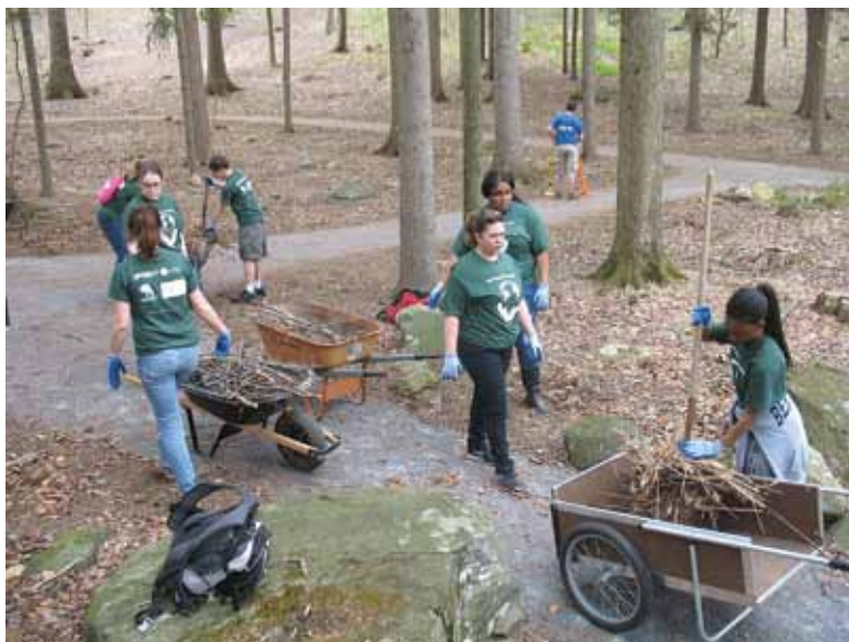
Taken on April 26, 2013, at Teatown Reservation. The club members were clearing debris in order to maintain an enjoyable nature preserve for the public.