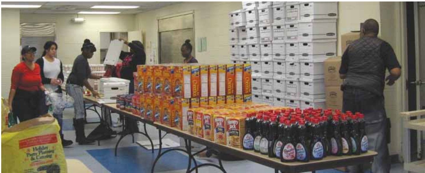
Hartsdale Rotarians and student volunteers packed boxes of food for 80 families in the Greenburgh area (photo above and below).

The Hartsdale Rotary Club once again joined with the members and volunteers at the Theodore D. Young Community Center to provide food and gifts for 80 families of the Greenburgh area during the Holidays. The Hartsdale Rotary would like to thank the Rotary District #7230 for their matching grant that made this possible.