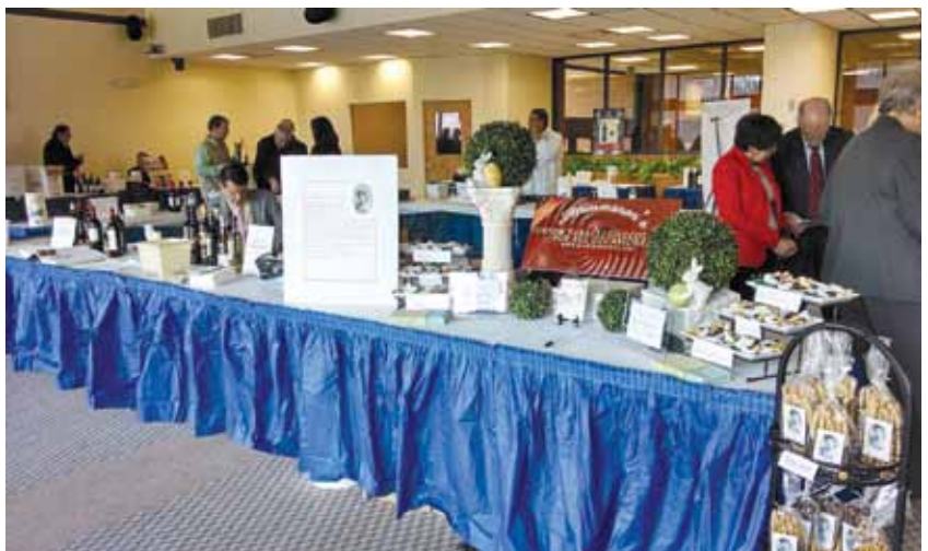
Crowds enjoys delicious foods, wine and beer and the song was provided by 100.7 WHUD.