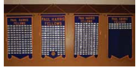
How a 106 member club honors its 378 Paul Harris Fellows.