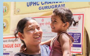
Maternal and child health