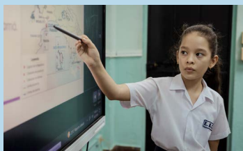
Basic education and literacy