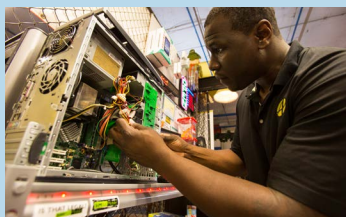
Community economic development