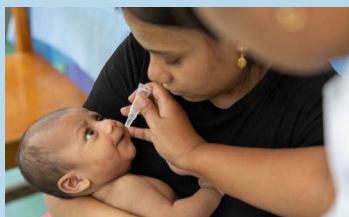
Disease prevention and treatment