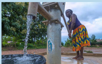
Water, sanitation, and hygiene