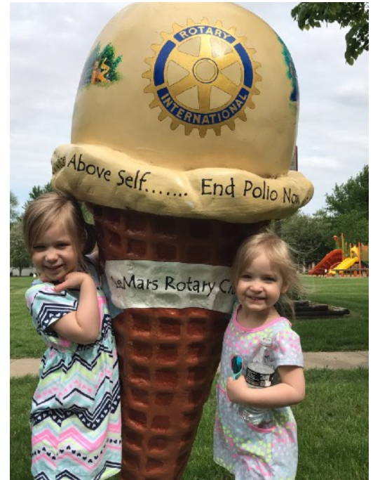
Visitors from New York enjoying LeMars park!

District website Registration will be available by July, 2017