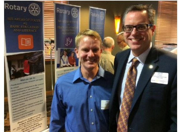
Presidents-elect networking during a break in all-day training.