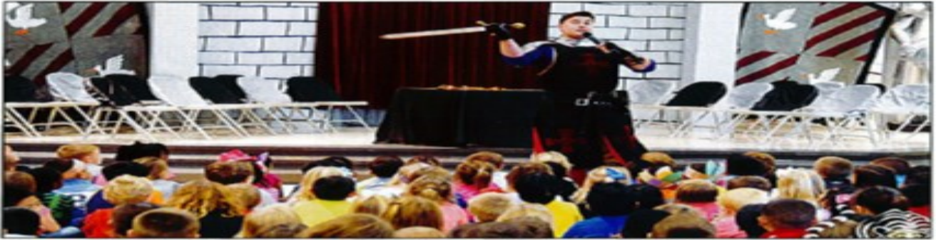
The county's Rotary Clubs and Smithville Education Foundation brought EAFK program to Brown Primary.