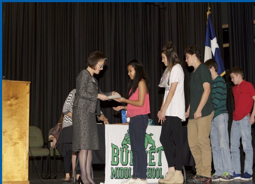
Burnet Middle School Interact Club