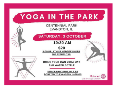
Rotaract club event