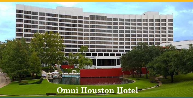
Omni Houston Hotel

Discover the luxurious oasis at the Four Star Omni Houston Hotel. Situated on impeccably manicured grounds, the Houston Galleria hotel features the finest in Houston accommodations. You are just 10 minutes by car from the central business district and 30 minutes from George Bush Intercontinental Airport or 25 minutes from William P. Hobby Airport.