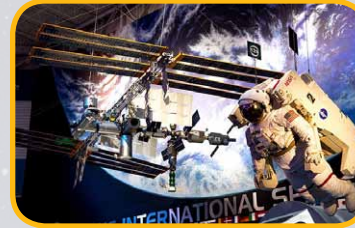
Space Center Houston

Come early and stay late to experience Houston!