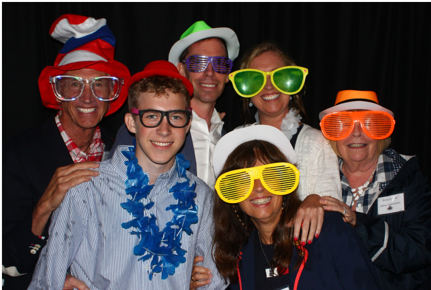
Asbury Park Rotary, as usual, the life of the party!