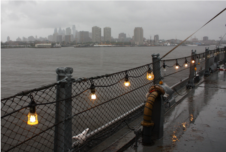
Philadelphia skyline, barely visible