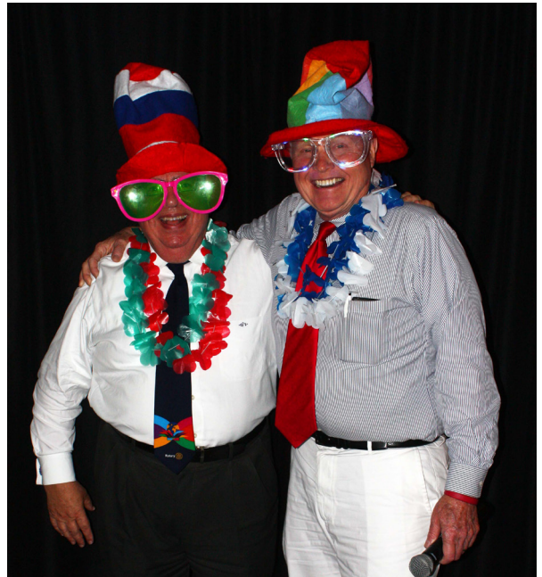
Somewhere in there is a District Governor...