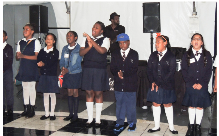
Children's choir from the Camden Forward School