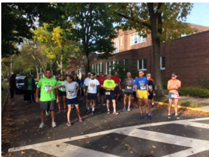
PRC Rotary and their Interact club operated a successful "5K for Life" 5K race.