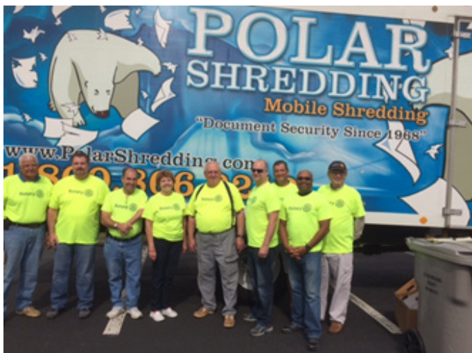
PRC Rotarians during their Community Shred Day