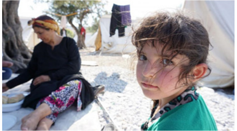
A refugee family from Syria seeks shelter in cramped conditions on the Greek island of Lesbos.