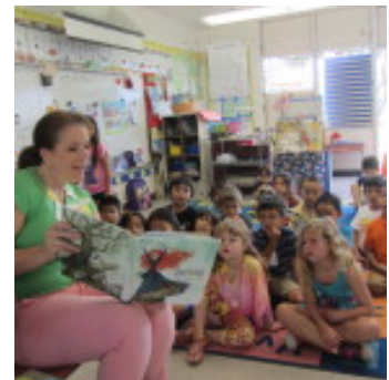
Rotary Reads to Kindergarten