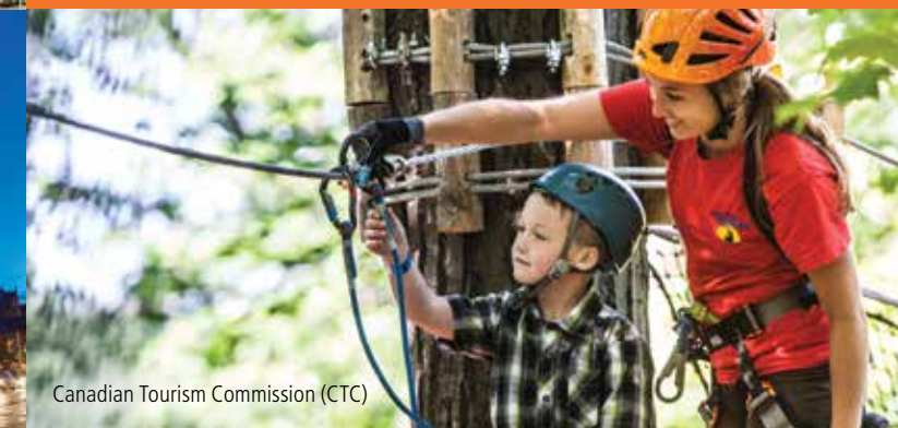
Canadian Tourism Commission (CTC)