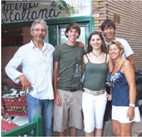
Youth Exchange Students become part of their host Families.

The Rotary Short Term Exchange Program (S.T.E.P.) is an amazing learning opportunity. The local program is open to students ages 15 ½ to 18 ½ who live or attend school in Rotary District 7390, which includes 45 clubs and more than 2,300 members located in 7 Counties of Central Pennsylvania.