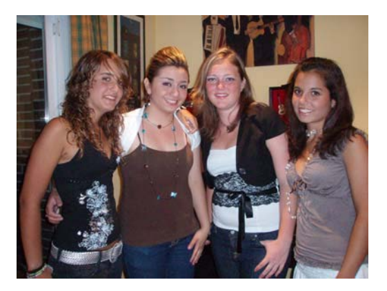
Exchange students develop friendships with their host families. These friendships can span continents and last a lifetime.

parents' discretion. In previous years, an allowance of $250 to $500 has been sufficient.