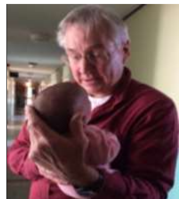
Heartlands Volunteer caring for baby