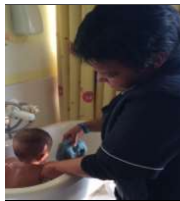
Tender loving care