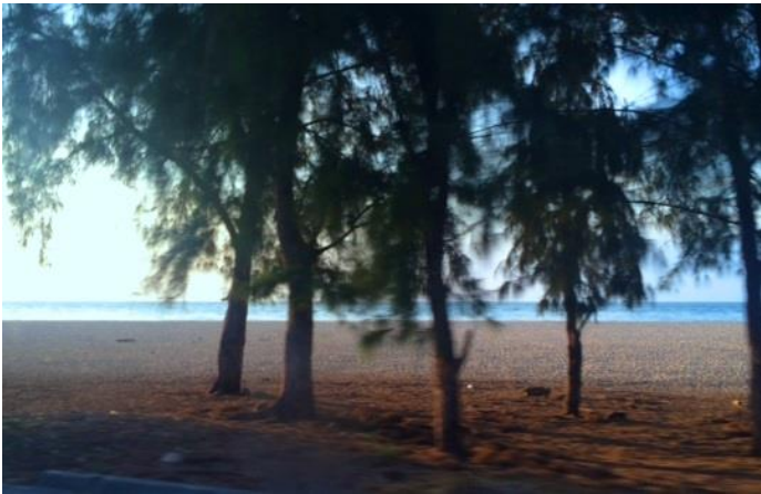
Sun drenched beaches at beautiful Lobito