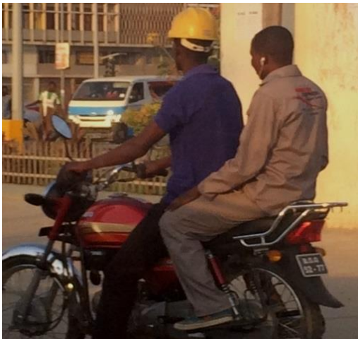
Taxi ? Motor cycle taxis outnumber the blue combi taxis