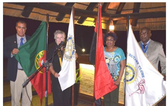
Lobito Club:- Flag Ceremony Welcome