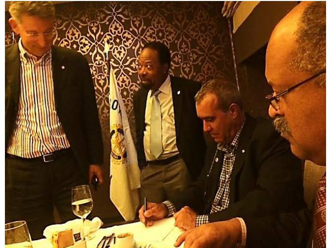
Combined meeting with Luanda and Luanda Sol Clubs