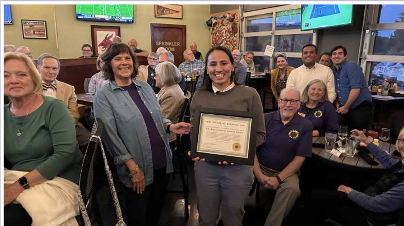
▲ Rep. Sharice Davids with much of the group at the HSFT event on October 16, 2024