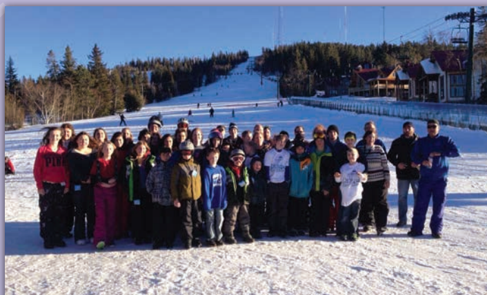
The "Riding on Insulin" family diabetes camp, held annually at Terry Peak Ski Resort in the Black Hills of South Dakota.

Diabetes Incorporated provides help through diabetic support groups and programs for the diabetic community. Diabetes Inc., supports diabetic students and their families through college "Community Contribution" scholarships. They produce a semi-annual newsletter, "Diabetes Beat" which is distributed free of charge. A "Newly Diagnosed Care Package" that includes supplies and educational materials for children and their parents is given to any child who has been newly diagnosed. There are also provisions for emergency medical supplies and