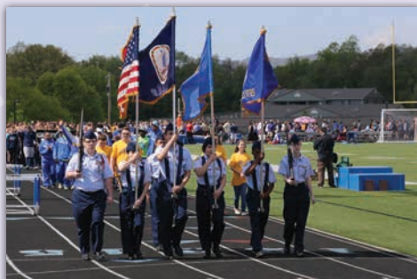
Parade of Athletes at the 2015 Cosmo Track Meet, WFHS Color Guard