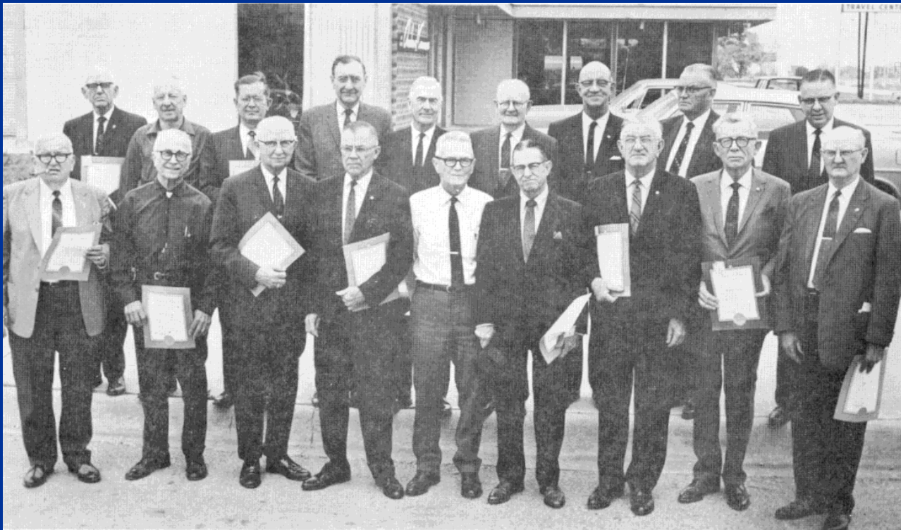
MEMBERS LEGION OF HONOR 1959

A Kiwanian who has been a member for twenty-five years is eligible to election to the Legion of Honor.