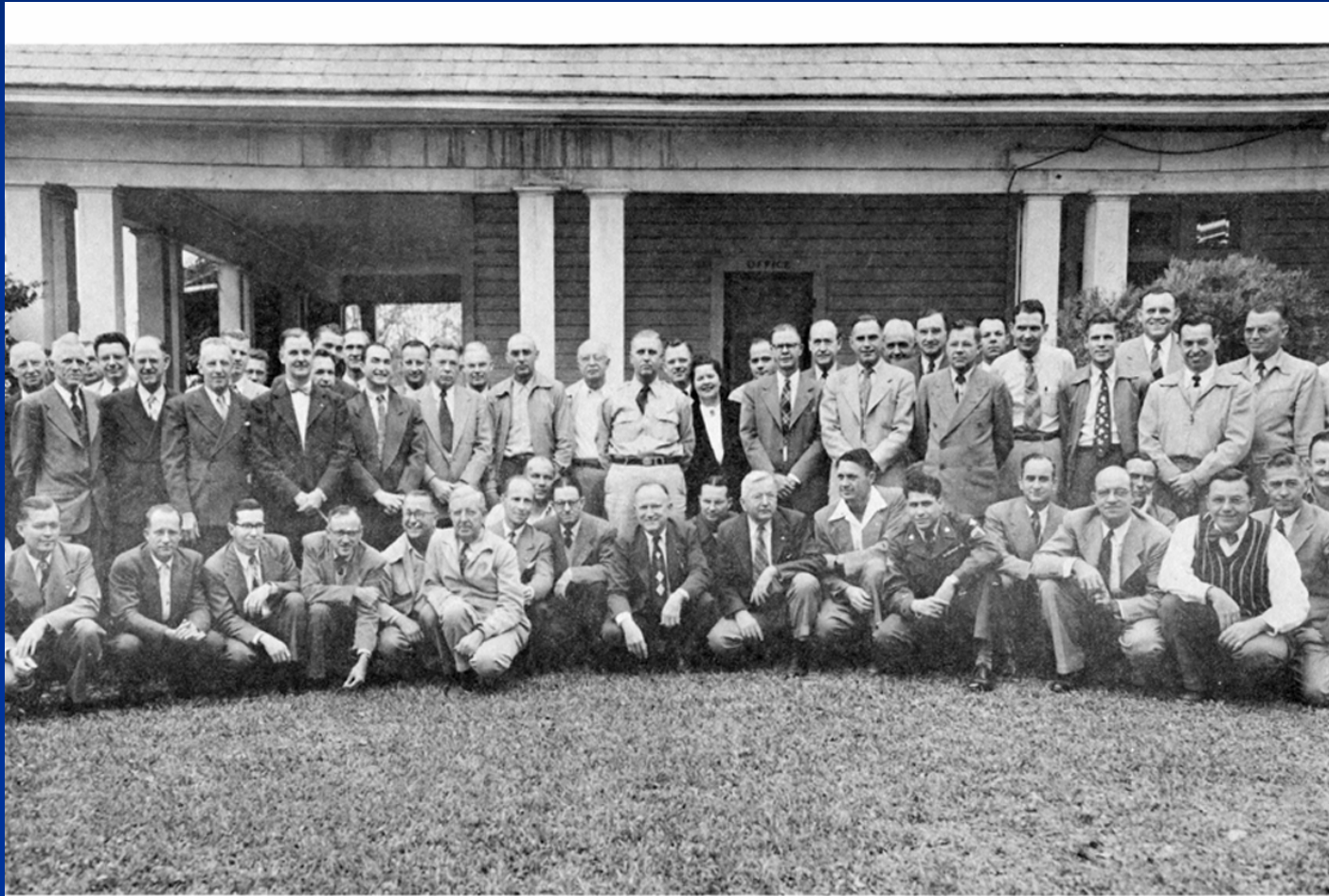
CLUB MEMBERS IN FRONT OF JULIA'S TEA ROOM 52