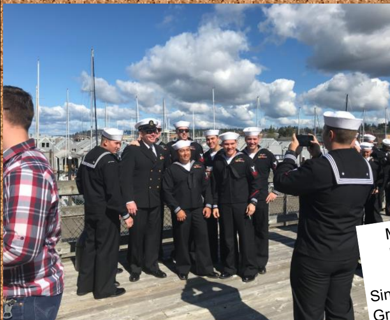
Navy Luncheon at OYC March 19th

You will be an active member of the Bridge and the work is rewarding. Contact me at any time if you want to talk further. We need to know by the end of this month.