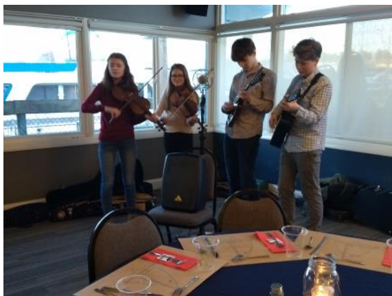
March 3 Dinner Auction