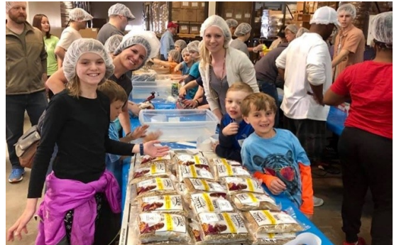
Pack 8023 Cub Scouts put together lunches for local kids.