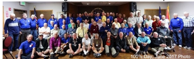
100% Day, June 2017 Photo