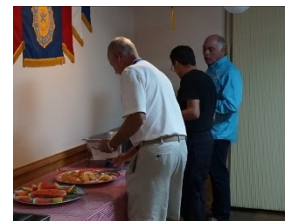
Breakfast buffet line.