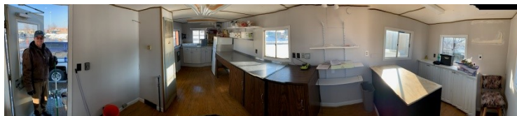
A panorama photo of the trailer renovation completed by many. Photo shows Tom Kramis at the door.

He continued with we need all hands on deck for this weekend. We should sell most of our trees by next week. To date we have sold 1,040 trees. We need 19 more members to work the lot to reach our goal of 100 members who have worked the lot. It took a total of 171 volunteer hours to fix up the Tree Lot Trailer, but what a difference it has made.