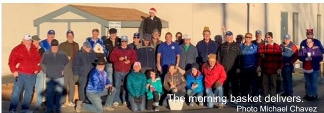
The morning basket delivers.