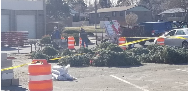
The Tree Lot on Sunday, December 23rd with just a few trees left.