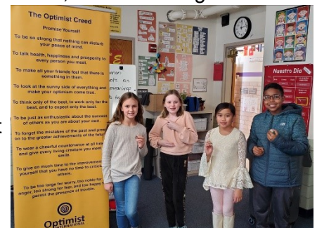
The officers of the Bradley Helping Hands JOI Club.

A lot of the JOI Club kids are former Super Citizen winners and have seen many