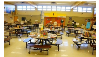
more can be found by CLICKING HERE.