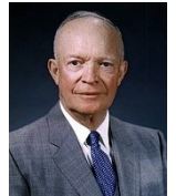
Dwight D. Eisenhower 34 th President