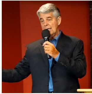
Ed Greene

Ed shared memories of when they would draw the weather patterns and conditions on dry-erase boards, then went to magnetic boards and finally to computer