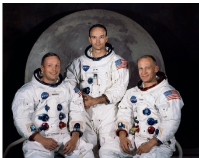
Left to right: Neil Armstrong, Michael Collins, Buzz Aldrin.

On this day in 1969, the Apollo 11 astronauts made history when the first man is landed on the moon by the United States and Neil Armstrong and Edwin 'Buzz' Aldrin became the first humans to set foot on the Moon