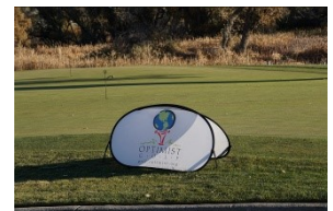
Photo of Optimist Golf sign at Green Valley Ranch 2019