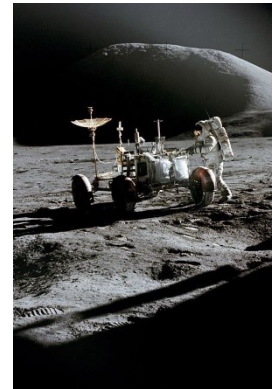
Apollo 15 astronauts take a 6 ½ hour electric car ride on the moon.

Tot" Day ... the last day of the officially sanctioned rum ration in the Royal Navy ... a practice started in 1740; 1971, Apollo 15 astronauts take a 6 ½ hour electric car ride on the moon; 1972, Thomas Eagleton withdraws as the Democratic Vice President candidate; 1988, The last Playboy Club closes in Lansing, MI; 1990, Nolan Ryan records his 300 th career victory; 1995, Walt Disney announces the acquisition of Capital Cities/ABC for $19 billion ... network of properties now consists of Disney, ABC Sports, ESPN, and ESPN2; 1999, Discovery Program: Lunar Prospector is deliberately crashed on the moon by NASA, ending its mission to detect frozen water on the moon's surface; and 2012, Michael Phelps becomes the greatest medal winner in Olympic history with his 19 th career Olympic medal and his 15 th overall gold medal.