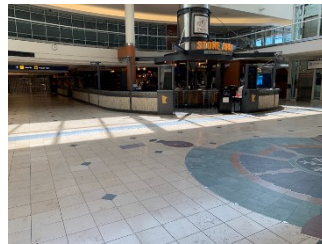
Minneapolis-Saint Paul International Airport is a ghost town as you walk through it.