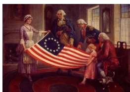
A Betsy Ross depiction Humphrys Flag Company