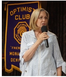
Frances Owens