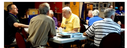
As shown above and below camaraderie around the room was abundant.