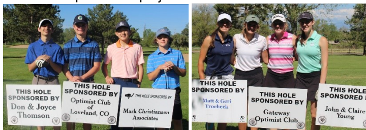
June 7 Overland, boys 10-15 & June 19 Meadow Hills, girls 10-18