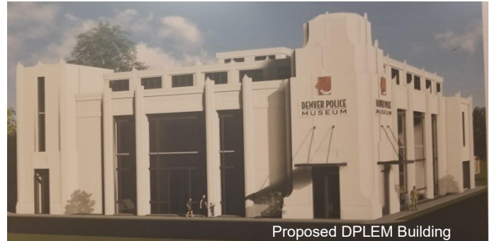
Proposed DPLEM Building

Legion Hall parking lot. Donations for the new museum building can be made at the DPLEM website @ www.denverpolicemuseum.org .