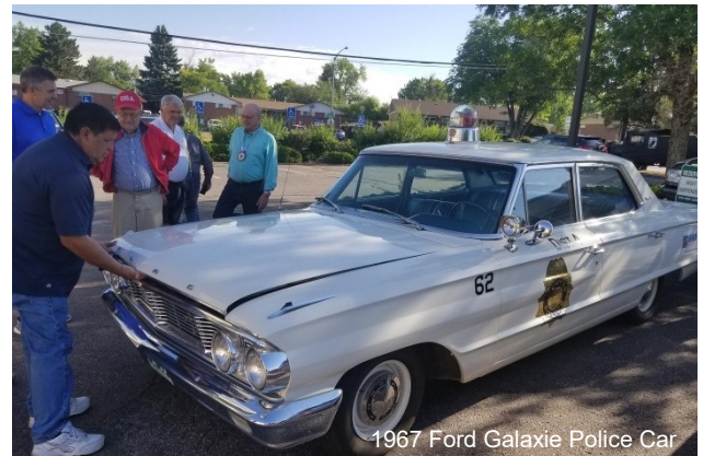
1967 Ford Galaxie Police Car