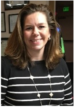
Kristin Friedrich

Do you ever smile at strangers? Do you say, "Thank you!" when someone holds the door for you? Do you wave when someone allows you to merge in traffic? Do you ever strike up casual conversation with the patron in front of you while waiting in line at the grocery store?