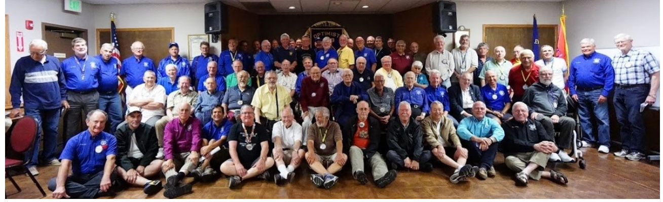
Photo Cindy Eley—photo can be found at <a href="https://goo.gl/photos/YNai8Y3awiwyUA5S9">https://goo.gl/photos/YNai8Y3awiwyUA5S9</a>