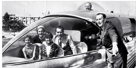
President Nixon's family in the front of the monorail, with Art Linkletter in the dome, while Walt Disney sends them off.