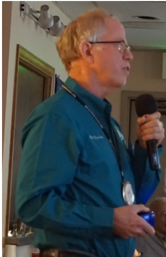
Bill Blunden

The Iraq government has awarded a 2 billion USD contract to Italian company, Trevi to resume grouting the foundation and make repairs to the dam. However, no long-term solution appears to be viable any time soon.