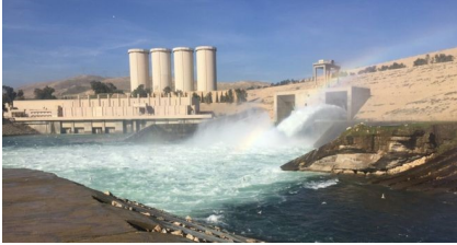
The Mosul Dam, the largest in Iraq, holds back billions of cubic meters of water.