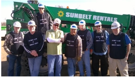
See this team work by clicking the above picture or links below.

Habitat for Humanity: About half dozen members worked on the habitat build last Thursday, March 9 th . They did exterior painting on the siding that we installed last time we worked on the houses.