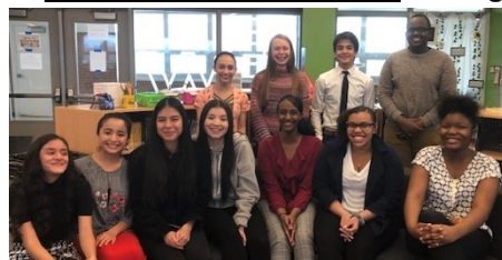
The 2020 George Washington High School Oratorical Contest participants.