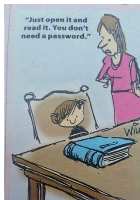
"Just open it and read it. You don't need a password."