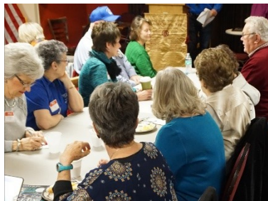
Some of the Optimist ladies gather at the center table.

A breakfast buffet of delicious French Toast, scrambled eggs, sausage patties, fresh fruit, Danish, juice, and plenty of hot coffee was presented in sumptuous portions.