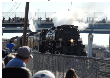
The UP #4014 arriving for Cheyenne Station ceremony.

Greg Hurd shared, the Union Pacific is having three historic ceremonies plus a joint ceremony with the National Park Service regarding the restoration of their Big Boy, #4014 locomotive and the 150 th anniversary of the golden spike. The UP 4014, Big Boy, is the largest steam locomotive ever built in the world and 4014 is the only Big Boy that is operable today. It has taken over 3 years to restore the