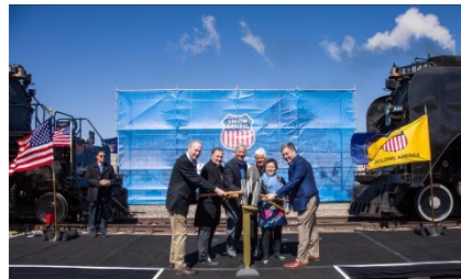
The UP golden spike ceremony in Ogden, UT May 9th.