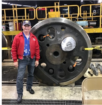
Below, the UP 844 that pulls Cheyenne Frontier Days train from Denver & engineers controls.