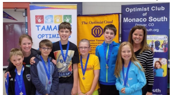
The Slavens “Muppets Who Fall on Their Swords” first place team.