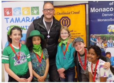
Southmoor "Mockingjays" second place team.

The Southmoor "Mockingjays" and " Hunger Games "