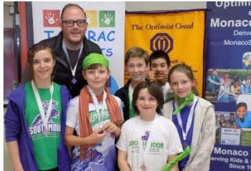
Southmoor "Hunger Games" third place team.

teams placed second and third respectively. We thank the volunteers from both Tamarac and Monaco South for helping make this a successful event for the students. We had many positive comments from the teachers and parents of the students.