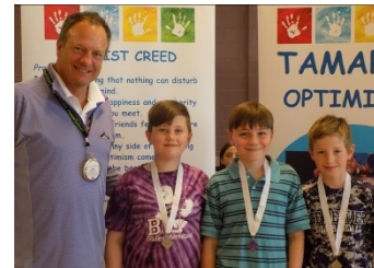
Bradley International third place winner.