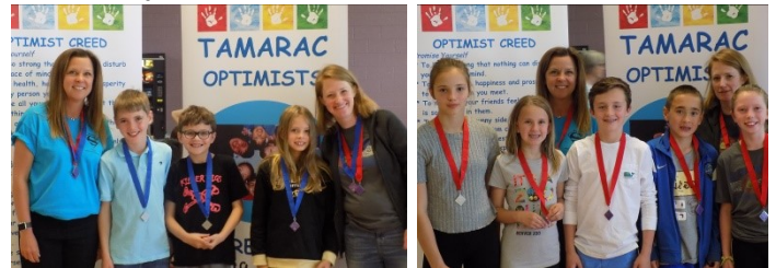
Slavens Elementary first & second place winners.