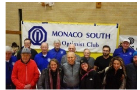
Some of the members who participated last year at the Boys & Girls Clubs dinner.

families really enjoy this dinner. This is exactly what the world needs now. Once again, save the date, the Bill Walters Thanksgiving Dinner , will be at the Boys & Girls Clubs, 3480 W. Kentucky Ave. and Girls Inc., 1499 Julian St., on Tuesday, November 21 st starting at 3:30 p.m.